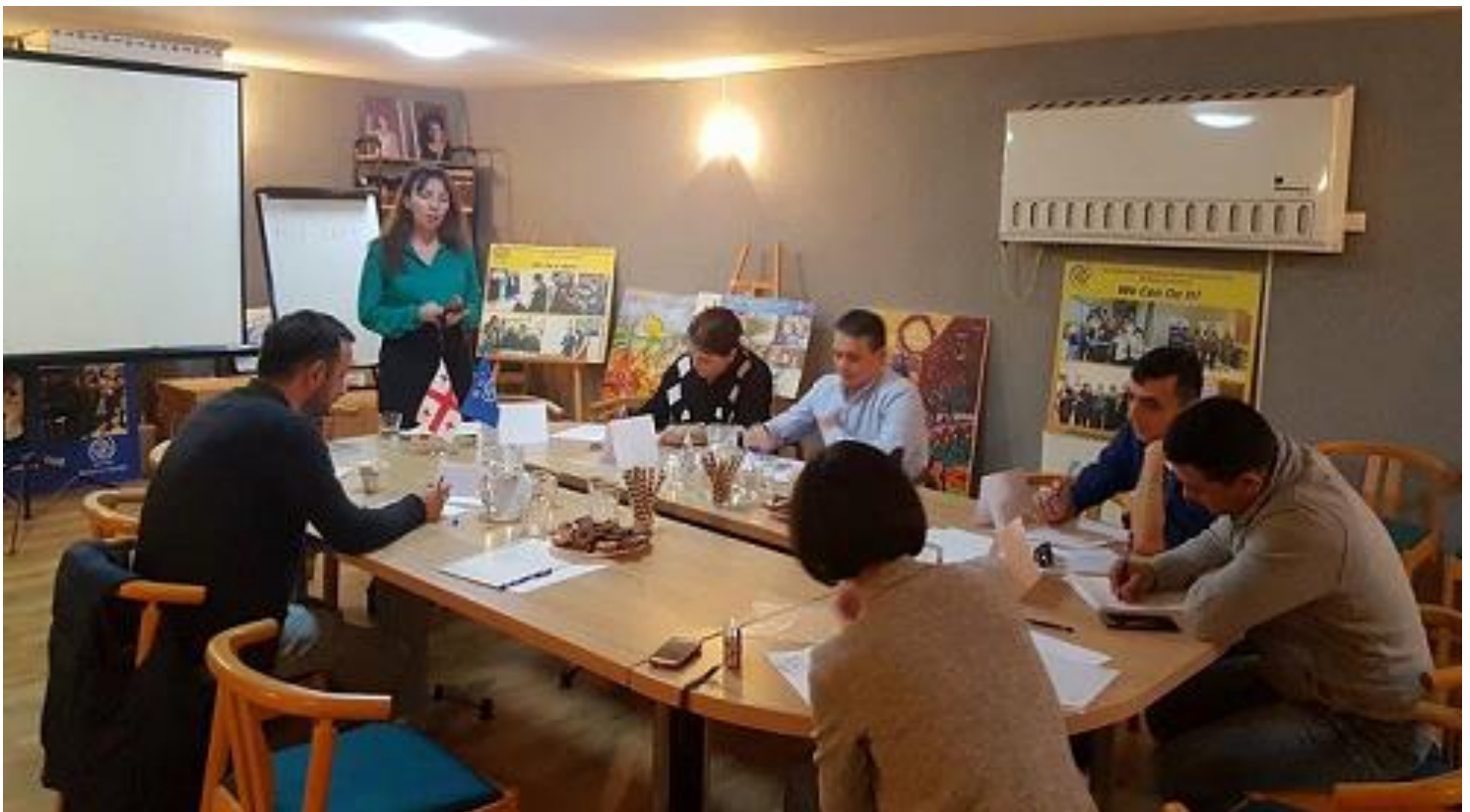
Job Orientation training for returnees from Belgium, Tbilisi, 2017

Valid ID and all relevant work related documents, such as diploma for proof of education, qualification and work experience.